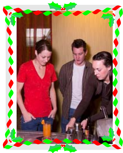
First place team in action!